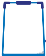
Flip Chart Paper